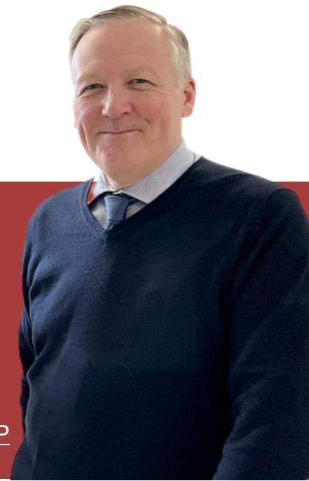
Rt Hon Kevan Jones MP