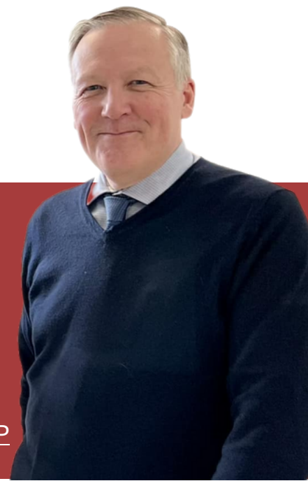
Rt Hon Kevan Jones MP